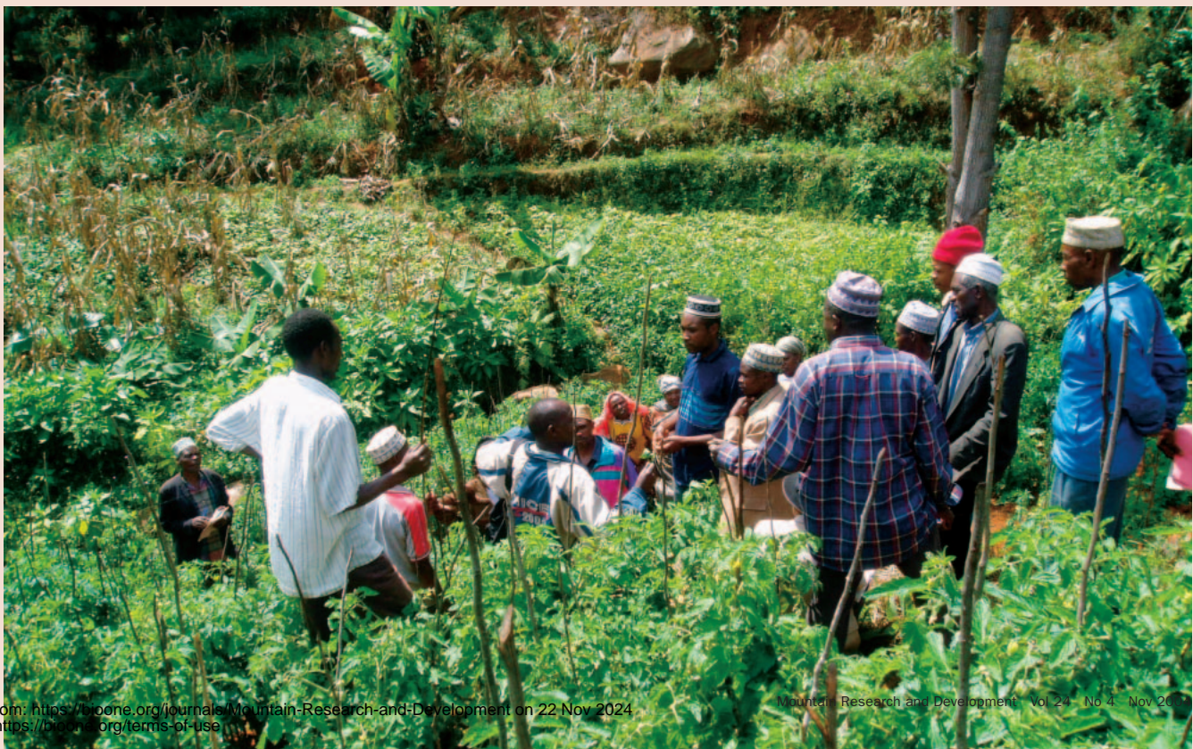
FIGURE 3 Farmers' Research Groups visit their experimentation plots in Lushoto, Tanzania.

There is a risk that market-oriented production may result in the capture of benefits by the rich to the detriment of the poor, or create a privileged group of farmers with access to new markets. There are also concerns that commercializing small-scale agriculture may widen gender inequalities and have negative effects on household food security and nutrition. A proactive gender and equity strategy should encourage and sustain active participation, and cooperation of both men and women in different wealth categories. Efforts geared towards strengthening and building more inclusive and equitable farmers' organizations and other local institutions are needed to foster collective action in production and marketing, and increase economies of scale, efficiency, and the competitiveness of community agroenterprises. Policy advocacy is required to make markets work for poor farmers in marginal mountain areas.