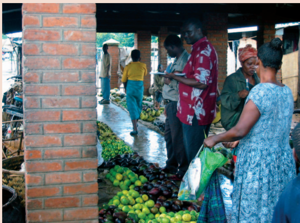
FIGURE 2 A market visit in Salima, Malawi.

To be competitive, farmers need new knowledge, information, innovation and skills that allow them to sustain more intensive, market-oriented production and overcome production constraints. Experimentation provides farmers with opportunities to try out a range of options to eliminate constraints in production, adapt them to their situations and circumstances, and build local capacity to find solutions to production problems. Farmer experimentation follows the principles of participatory technology development (PTD), the key to increasing competitiveness and sustainability and reducing risk in new enterprises (Figure 3). This involves testing and evaluating improved crop varieties and livestock breeds, pest and disease management, better soil fertility, livestock management, and other improved agronomic practices.